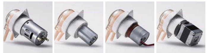
DC brush motor

The lineup also includes various types of motor for mounting, such as 12, and 24VDC low-speed and high-speed motors, stepper motors, and brushless motors, etc.